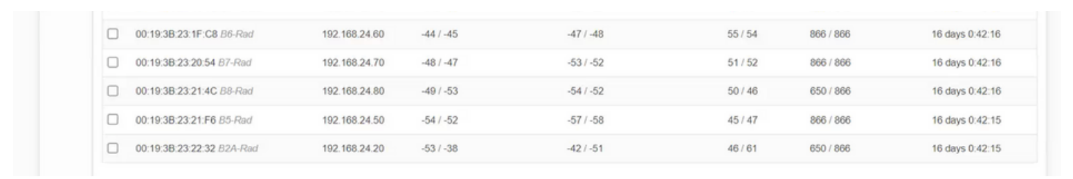
Signal levels range from -42dBm to -58dBm, averaging at -50dBm. The network manages to keep stable signal level for 16 days in a row.