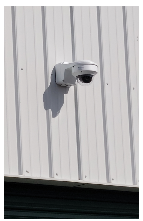
Issue: Lack of conduit infrastructure

Lock-It-Up self-storage, with 19 locations, wanted to upgrade their security system to modern IP cameras to increase visibility and provide added safety for their customers. However, the lack of conduit and limited space for equipment posed a challenge for implementing an IP camera system. GUT Consulting proposed a wireless solution using LigoWave equipment.